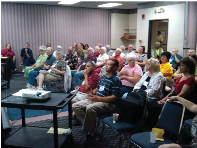
Conference attendees who came to watch and learn about Deaf Bilingual Coalition.