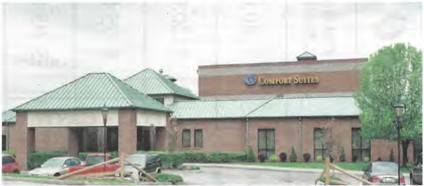
Comfort Suites ~ Mineral Wells, West Virginia